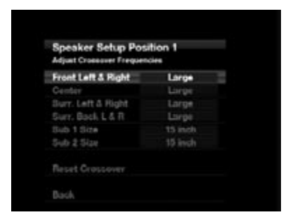
Figure 30 — Adjust Crossover Frequencies Menu

After you have programmed the number of speakers, the AVR will return to the Speaker Setup Position menu (see Figure 28). Navigate to the Crossover (Size) line and press the OK Button to display the Adjust Crossover Frequencies menu (see Figure 30).